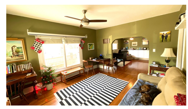
We bought our house in 2023 and renovated it, with the help of Trask's family, to make it into a cozy home. It's located in a diverse and walkable neighborhood, one block to the elementary school, and a short walk to the university and the farmer's market downtown.

Thank you for taking the time to read our profile and we wish you the best in the decision you make for you and your child.