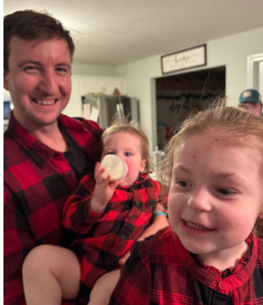
Enjoying happy times with our 7 nephews and nieces in New Hampshire