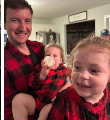
enjoying happy times with our 7 nephews and nieces