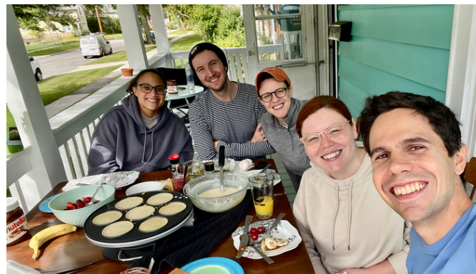
Weekend brunch on our porch with close friends, enjoying one of our favorite activities, making French crêpes !

We bought our home in 2023 and are grateful to have fully paid it off, giving us financial stability as we grow our family and our house itself with updates and an addition. On summer evenings you can find us on our porch, chatting with neighbors and their children as they pass, or in our backyard, grilling and playing fetch with Radley. We live in a diverse, walkable neighborhood, close to the university where we work, and only two blocks to the local elementary school. Our street is often alive with the sounds of kids laughing and playing.